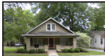
413 Hargrove Street